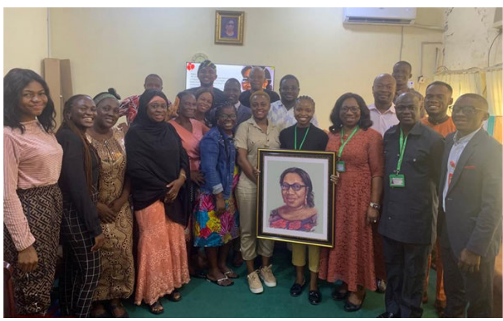
grateful for the achievements she has had and always for

September was a special month with the surprise celebration of our Director's birthday; honouring her for her visionary leadership and inspiration and constant admonition to us to always do our best and for providing us with opportunities for growth. We are